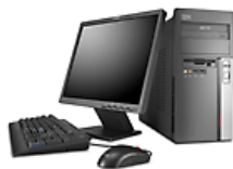
Staffs at Office